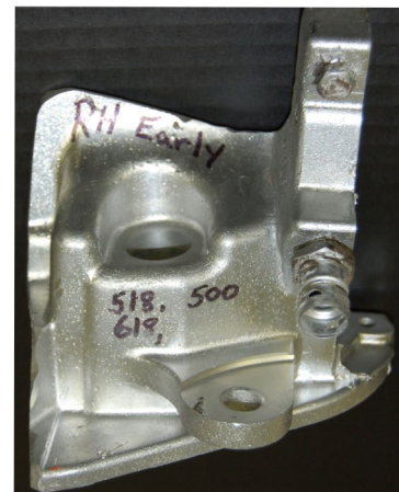
Chrysler 46/47RH (early model)

REQUEST THE BEST... ASK FOR GENUINE TECKPAK-FITZALL 1-800-527-2544 www.teckpak-fitzall.com