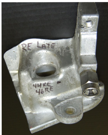
Chrysler 46/47/48RE (late model)

NOTE: The 47RE must have a screw in neutral safety switch in order to be used.